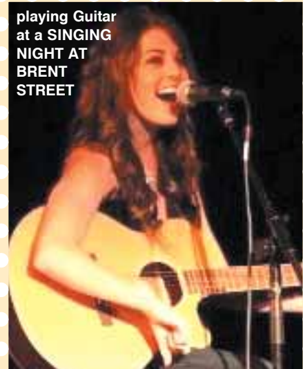
playing Guitar at a SINGING NIGHT AT BRENT STREET